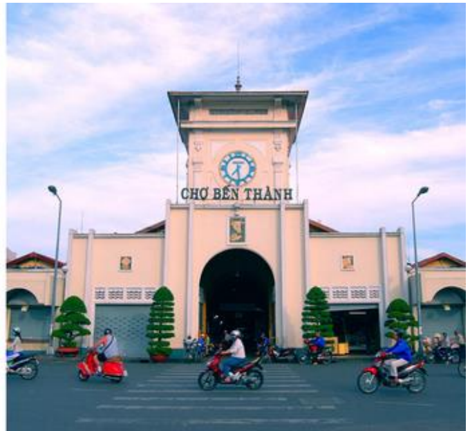
Ben Thanh Market